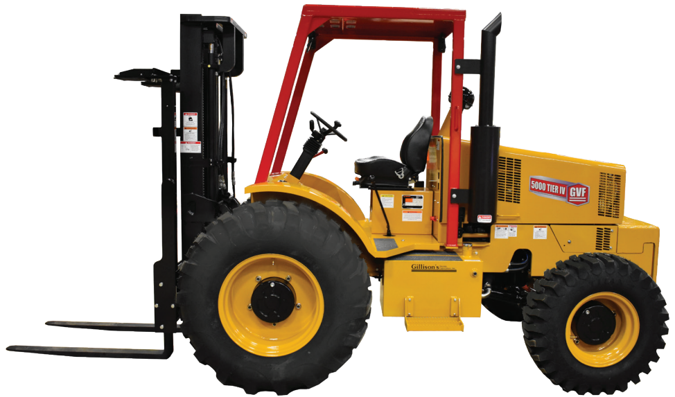
GVF 5000 Forklifts shown with bin clamps.