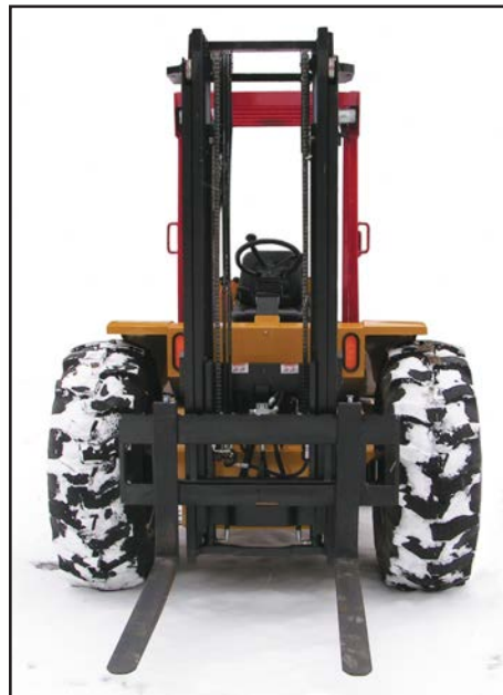
New ESO-MS Mast offers better visibility.