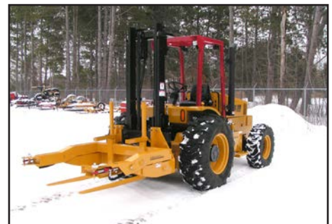
GVF 5000 shown with GVF Bin Dumper