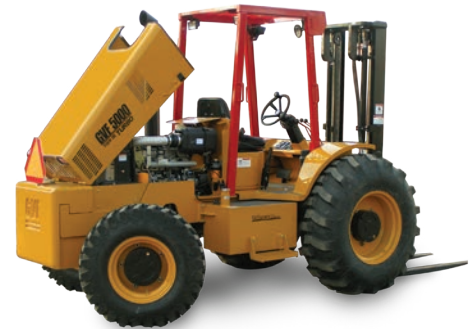
GVF 5000 Tier III Turbo