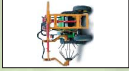
Grape Hedger and Cane Positioner