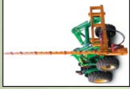
Loader Mount Hedger