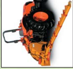
3 Pt. Skirter