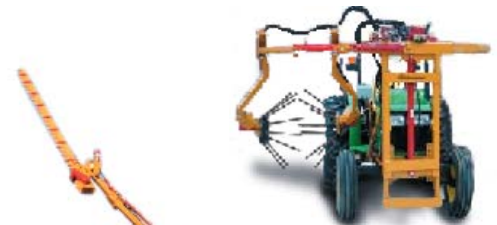
Grape Hedger and Cane Positioner