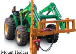
Loader Mount Hedger