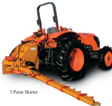
3 Point Skirter