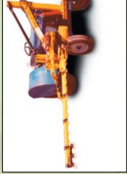
Hedger and Skirter