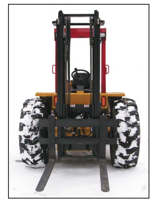
New ESO-MS Mast offers better visibility.