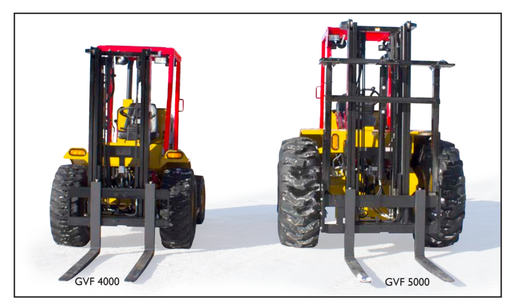
On the left is the GVF 4000 - Compact design to navigate narrow rows and tight spaces. * See separate literature.