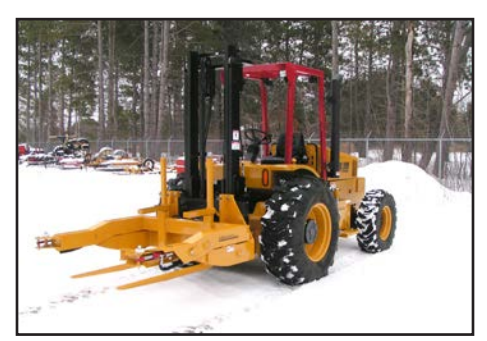
GVF 5000 shown with GVF Bin Dumper