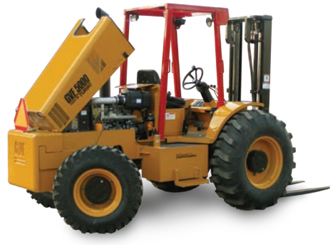
GVF 5000 Tier III Turbo