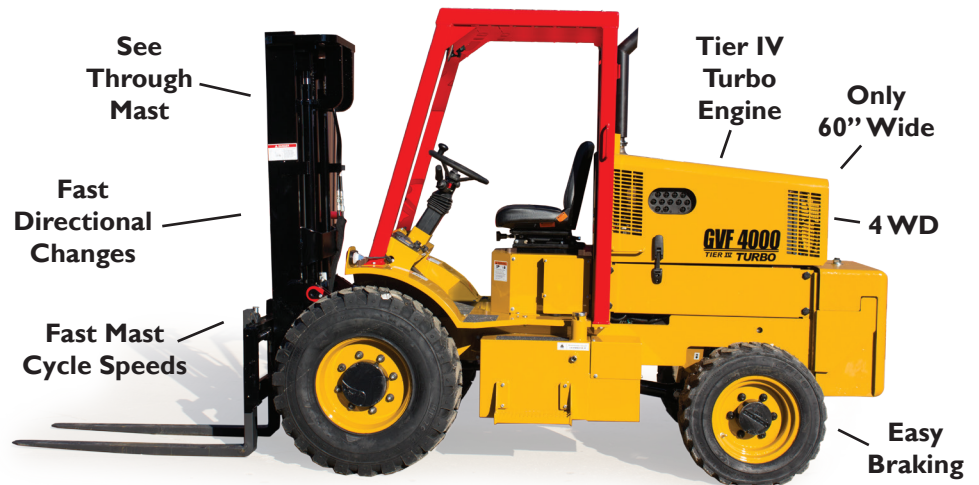
GVF 4000 - Compact design to navigate narrow rows and tight spaces.

GVF 4000 has a compact design with serviceability still in mind. The hood flips up 90° and the side panels remove to allow access to everything on the engine. Easily access the transmission and hydraulic components just by simply removing covers.