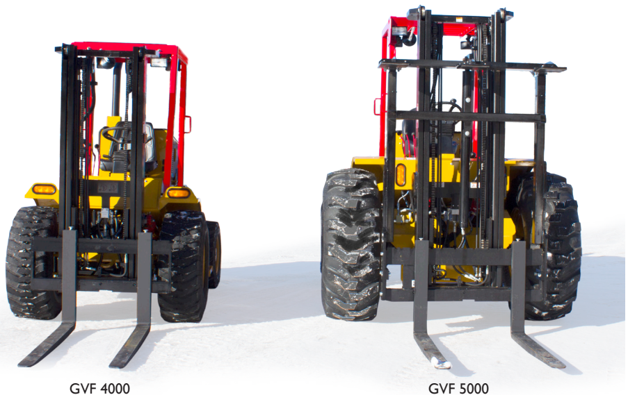
Side by side comparison shows just how compact the GVF 4000 really is.